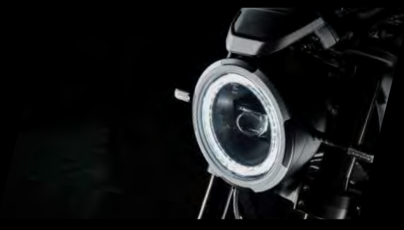
Full LED headlights