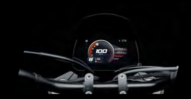
5" TFT screen Bluetooth connectivity