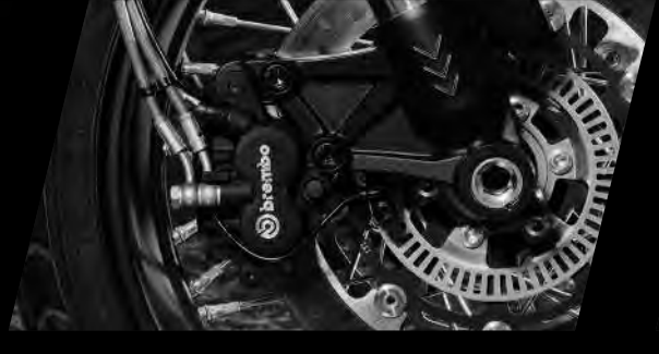
Brembo braking system