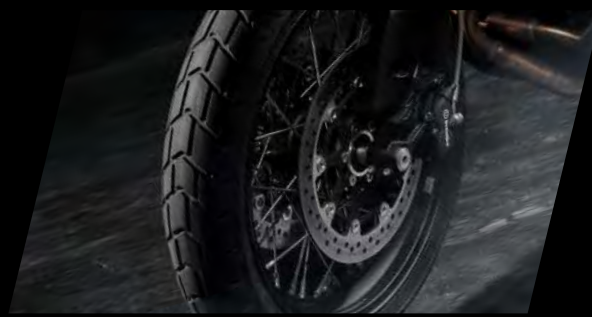
18" front and 17" rear Tubeless spoke rims Pirelli MT60RS tires