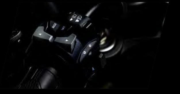
Backlit handlebar controls