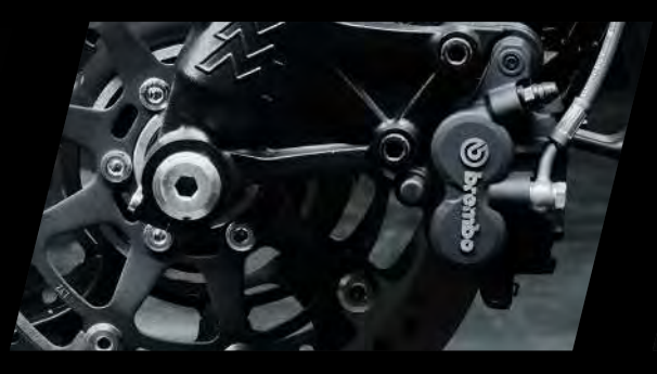
Brembo braking system