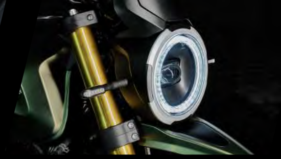
Full LED headlights Gold fork