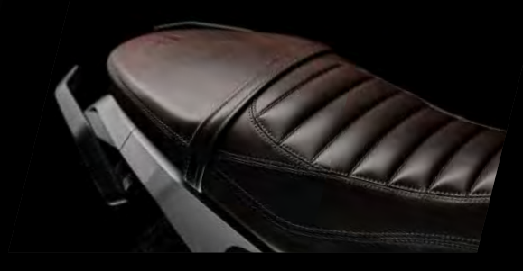
Standard handles Heritage saddle