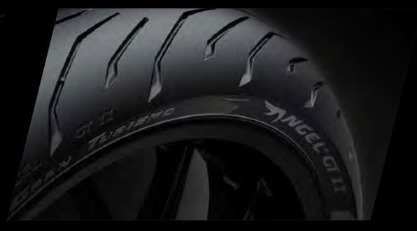
Pirelli Angel GT tires