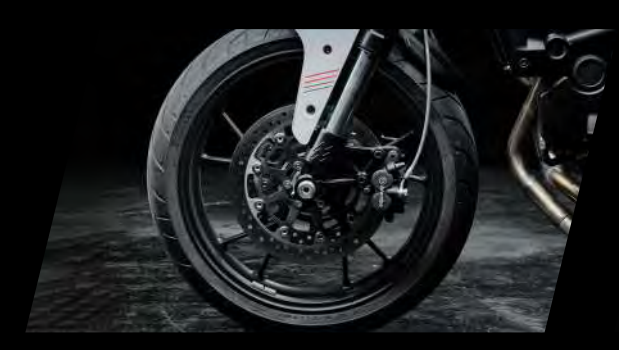
18" front and 17" rear Tubeless alloy rims