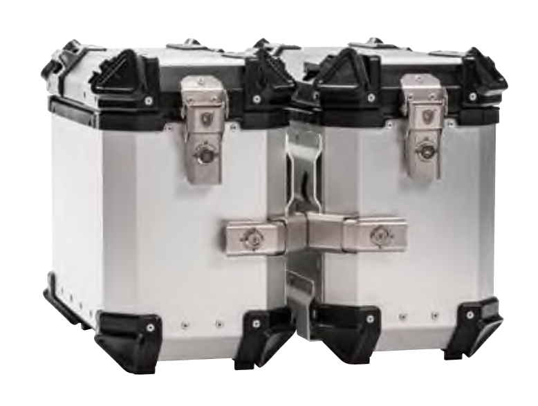
TRAVEL BAGS: ALUMINIUM TOP AND SIDE CASES