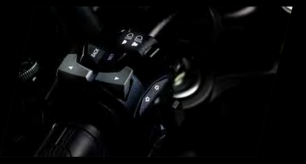
Backlit handlebar controls