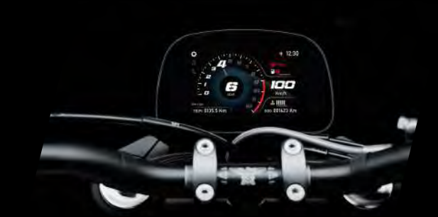
5-inch TFT screen Bluetooth connectivity